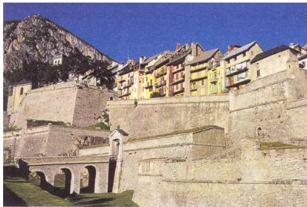
The Embrun Front with its colourful facades

"with regard to the terrain, it is difficult to imagine anything less even, with mountains which touch the sky and valleys which plunge to the depths. The ground between them is made up of these extremes with all the high and low imaginable and consequently extremely awkward for those attacking and those defending" Vauban.