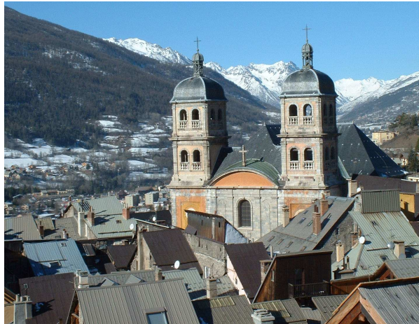
The Notre-Dame Saint-Nicolas Collegial Church

The ramparts of Briançon planned by Vauban, represent an excellent example of a bastioned wall adapted to steep terrain. The military architect managed to make the most of the natural defences on the Durance side, and also turned the difficulties of the neighbouring heights to his advantage.